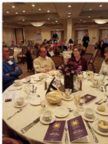
2017 CTC Annual Gala